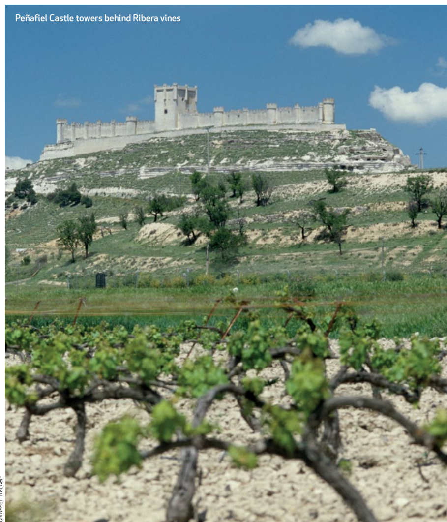
Peñafiel Castle towers behind Ribera vines

Valoria country roads lead back to Peñafiel and then across some of Castile's most rugged landscapes to the famous hilltown of Sepúlveda, strung out along a ridge. It stands at the head of the Hoces del Río Duratón , a magnificent winding gorge carved by the River Duratón and lined by cliffs that host the nests of griffon vultures. The gorge is now a natural park, great for walking and kayaking, and further west it contains one more historic monastery – Monasterio de la Hoz , a dramatic ruin above the river. And from Sepúlveda, it's a short run back to the motorways south.