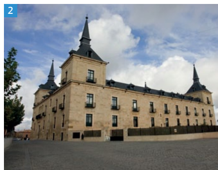
1 Romanesque cloister, Santo Domingo de Silos monastery 2 The majestic Ducal Palace in Lerma